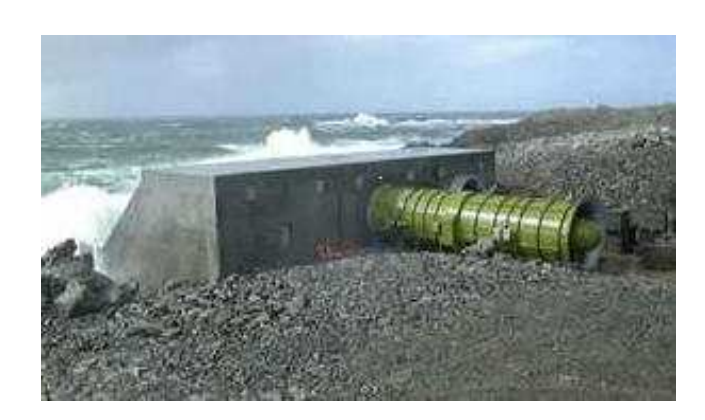
Figure 3: Shore Oscillating Water Column [3]