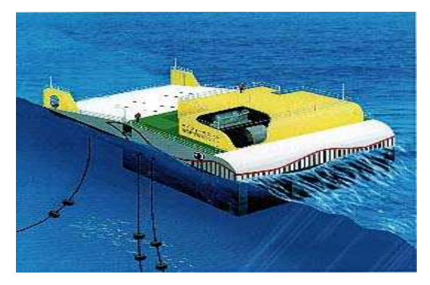
Figure 2: Offshore Oscillating Water Column [15]