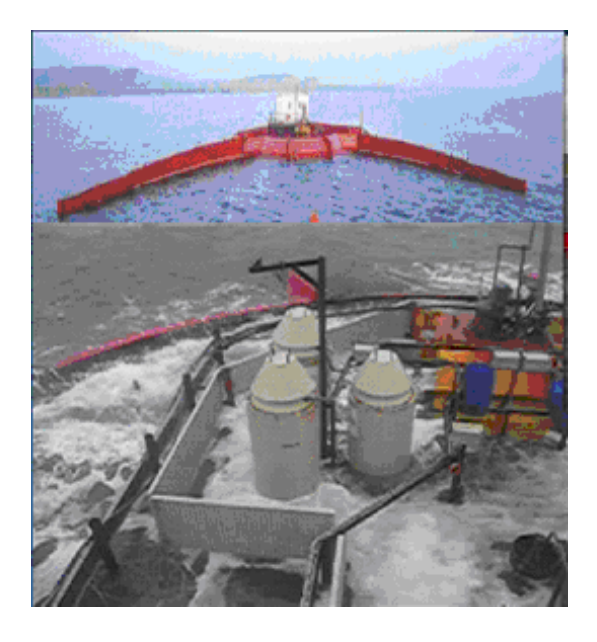
Figure 4: Wave Dragon Overtopping Device [14]